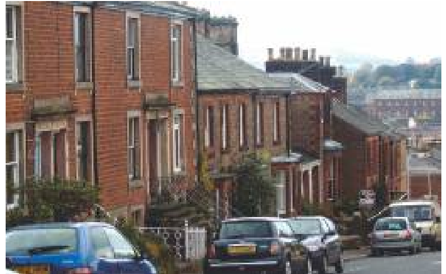
Arthur Street Sustainable Community